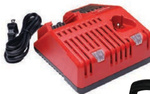
M18™ & M12™ MULTI-VOLTAGE CHARGER 64-48-59-1812