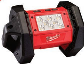
M18™ ROVER™ FLOOD LIGHT (TOOL-ONLY) 64-2361-20