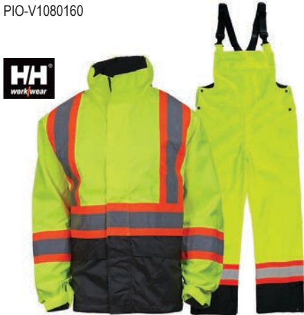
ALTA HI-VIZ WATERPROOF SHELL JACKET/BIB PANT CSA