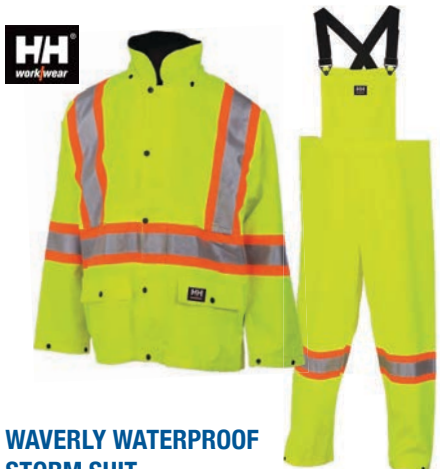
WAVERLY WATERPROOF STORM SUIT