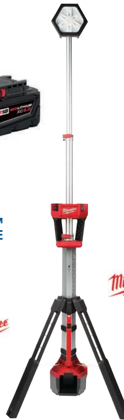
M18™ ROCKET™ DUAL POWER TOWER LIGHT 64-2131-20