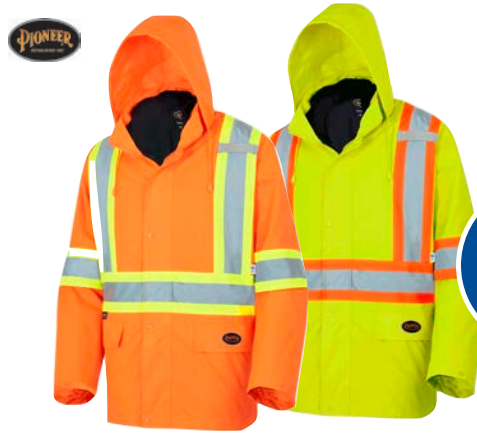
"THE ROCK" 300D OXFORD POLYESTER 3-IN-1 PARKA