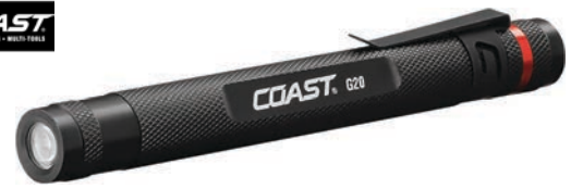
INSPECTION BEAM PENLIGHT - BLACK COA-30539