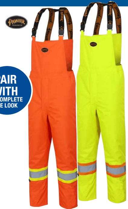
HI-VIZ "THE ROCK" 300D OXFORD POLYESTER INSULATED BIB PANTS