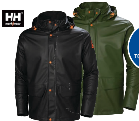
GALE WATERPROOF RAIN JACKET