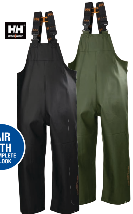
GALE WATERPROOF RAIN BIB