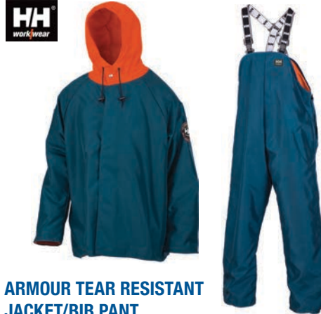
ARMOUR TEAR RESISTANT JACKET/BIB PANT