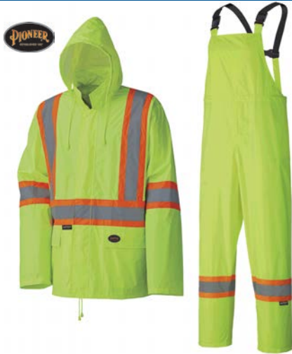
WATERPROOF LIGHTWEIGHT SAFETY RAIN SUIT PIO-V1080160